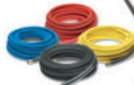
High-pressure hoses from 30 to 150-ft. lengths