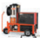
HOT-WATER PRESSURE WASHERS

NOTE: We are constantly improving and updating our products. Consequently, pictures, features and specifications in this brochure may differ slightly from current models. Flow rates and pressure ratings may vary due to variances allowed by manufacturers of our machine components. We attempt to keep our machine performance within ±5% of listed specifications.